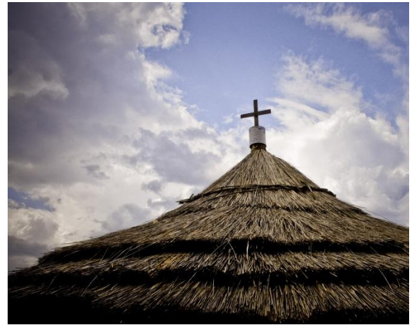
Pray that South Sudan continues to carry its witness into the 10-40 window

Besides having a full program of teaching and preaching, I was able to see many of my Sudanese friends- some of whom are family to me. This was my greatest joy in returning. Friendship matured during years of conflict and sorrow creates a bond that cannot be easily explained. As such, my returning to them was literally a dream come true. I thank God for allowing me to be a part of their lives. I thank each of you for faithfully praying and supporting us because that has enabled this ministry to take place. Clearly the needs and opportunities to minister in South Sudan are great, and I look forward to continuing my part in building Christ's Kingdom there. I have posted several more stories about my trip through South Sudan and Uganda on our blog (find out what a Boda-boda is and how to survive it).